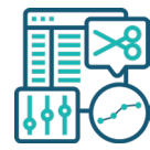
Mass editing tools