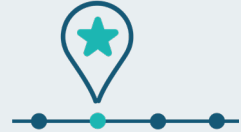
Automated points tracking