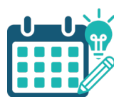
Schedule creation manager