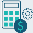
Pay calculation engine