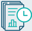
Real-time reporting with auto-distribution