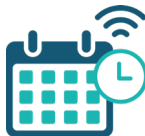
Offline punch capture