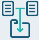
Drag-and-drop custom workflows