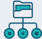
Data collection via timeclock, telephony, web, and mobile