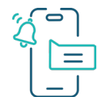
Automated, proactive SMS, email, and in-application push notifications