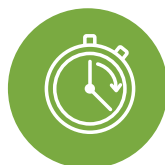
Time & Attendance Union Wage & Benefit Rates and Prevailing Wage Rates