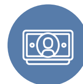
Payroll, Tax, Union Fringes, Certified Payroll Reporting