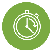
Time & Attendance Union Wage & Benefit Rates and Prevailing Wage Rates